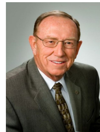
By James H. Hadfield, Mayor City of American Fork

As I write this article, I'm looking out my window, watching a steady downpour of rain – finally. After a very warm winter, with little moisture, the recent rain has been a blessing, but it's still not enough.